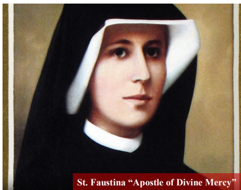
St. Faustina "Apostle of Divine Mercy"