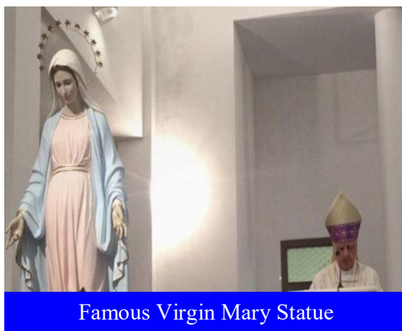
Famous Virgin Mary Statue