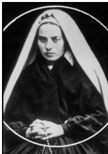
St. Bernadette Lourdes, France