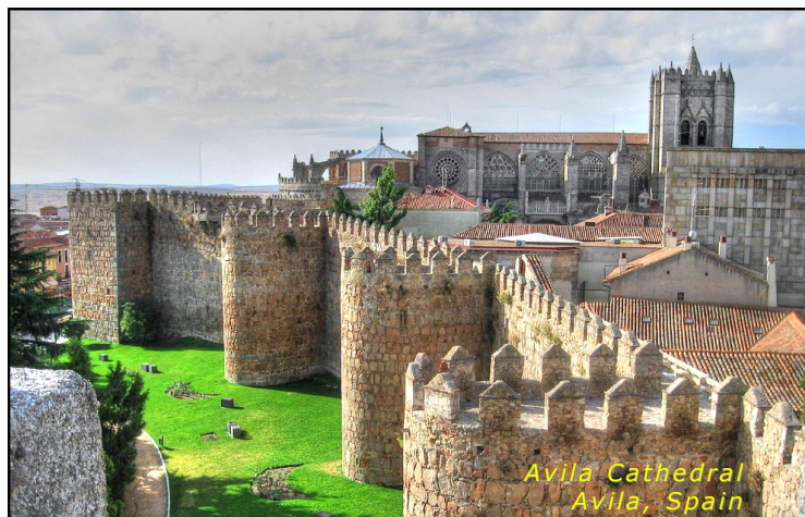
Avila Cathedral Avila, Spain