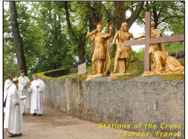
Stations of the Cross Lourdes, France