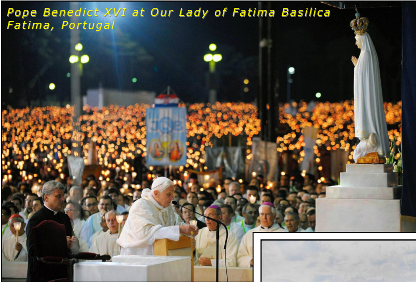
Pope Benedict XVI at Our Lady of Fatima Basilica Fatima, Portugal