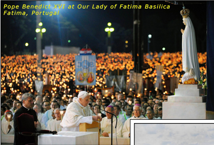
Pope Benedict XVI at Our Lady of Fatima Basilica Fatima, Portugal