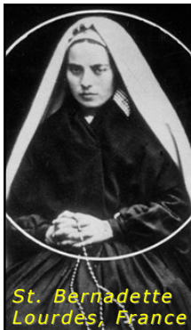
St. Bernadette Lourdes, France