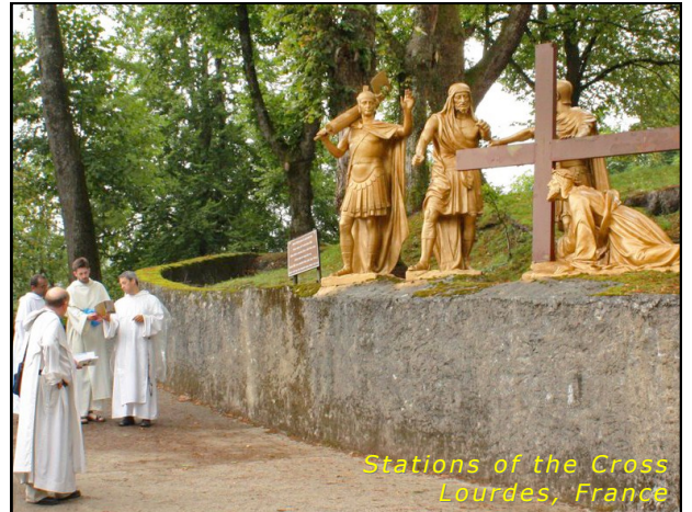
Stations of the Cross Lourdes, France